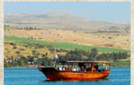
Sail on Galilee